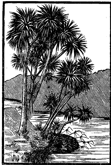
CABBAGE TREE, WAIHOU RIVER, AUCKLAND, N.Z.